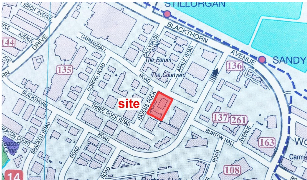
Figure 1 Location Map

The adjoining site to the east at the junction of Carmanhall Road and Blackthorn Road was formerly occupied by Avid Technology. It extends to 0.81 ha ((2.0 acre).